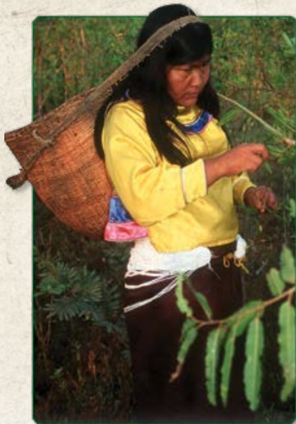
Wild Harvesting "Iporuru" (Alchornea castanifolia) a powerful whole leaf, that makes an Amazing Amazonian Tonic.