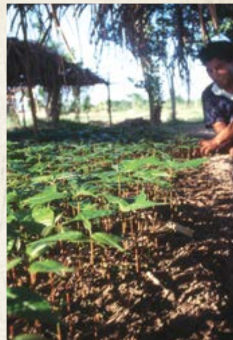
Nursery beds are set up for the cultivation of natural botanical trees and shrubs. The young trees are then transplanted back into the forest, or at the edge of grasslands where logging by timber companies or ranching has destroyed the jungle cover.